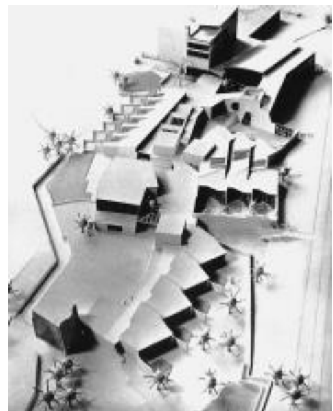
*Diagram and Photo: Darmstadt School by Hans Scharoun